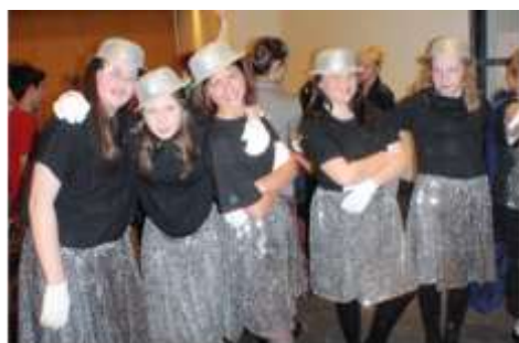
Middle 1 & 2 Dancers