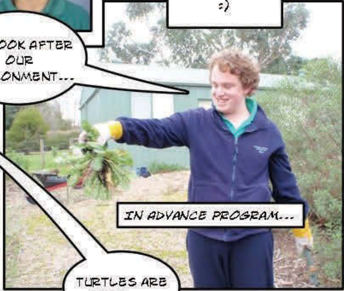
IN ADVANCE PROGRAM...