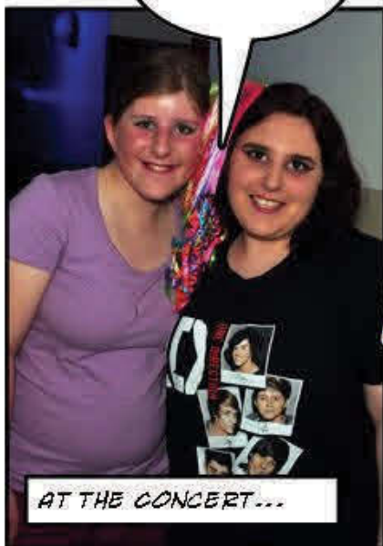
AT THE CONCERT...