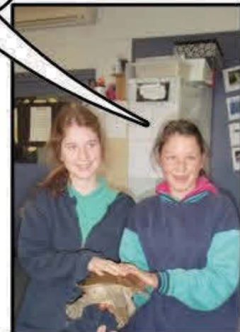
IN INTEGRATED STUDIES AND IN ALL SORTS OF OTHER ACTIVITES :)