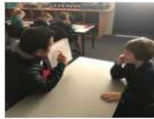
JB students continue developing their reading skills through the Reading Mastery.